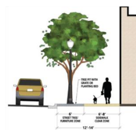
TOD Core Streetscape

Design standards/development principles have been adopted that support the SunRail Station and assist in retaining DeBary's distinctive character and southern charm .