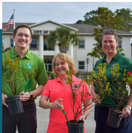
Mayor Chasez and Councilmembers Pappalardo and Stevenson at the Arbor Day Tree Giveaway