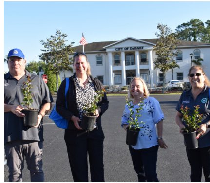
Mayor Chasez, Vice-Mayor Butlien, and Councilmembers Sell & Stevenson at the Arbor Day Tree Giveaway