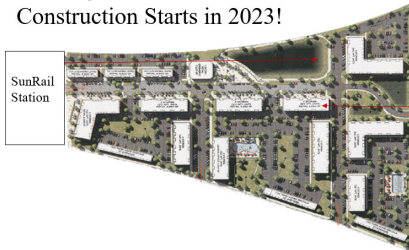
45,000 s.f. Commercial Retail on First Floor 1-2 Bedroom Apartments on 2 nd , 3 rd , & 4 th Floors Brownstone Apartments