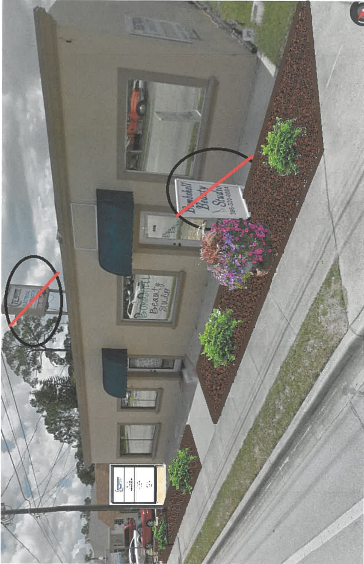
87-89 S C.R. Besll Blvd. Removal of 2 signs, Location of new monument sign, and landscaping proposal